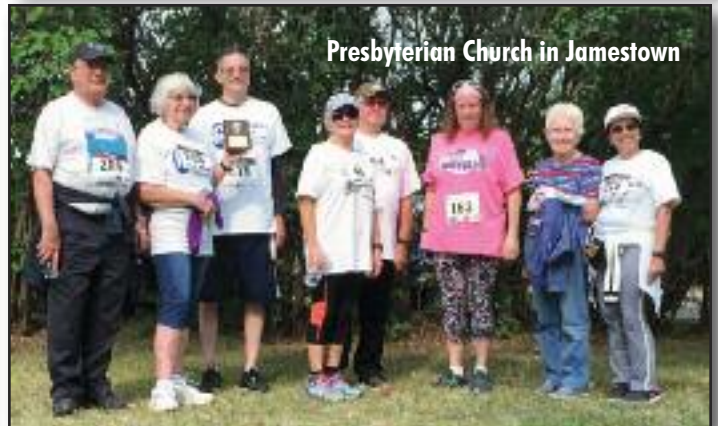
Presbyterian Church in Jamestown

Six residents were pushed along the course in their wheelchairs. Another walked it with her walker and a companion by her side.