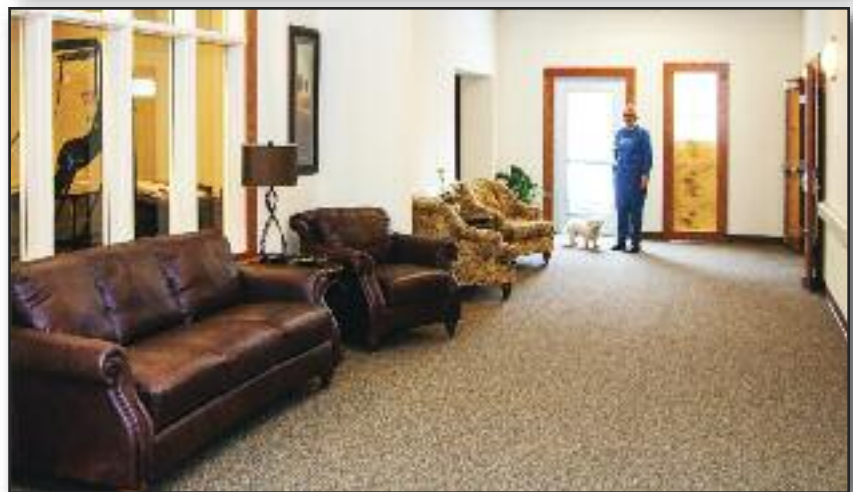
(Top) Good Shepherd Chapel. (Center) Gathering Place. (Below) McCoy Family Suite.